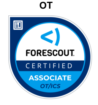
Certified Associate: OT/ICS

FSCA certified individuals can perform basic Forescout administration which involves basics such as navigating the console to determine which policies a device matches and finding various host properties.