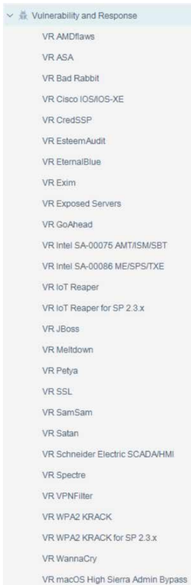
Here is a sample of current ForeScout Vulnerability Response Templates.

The security policy templates include the ability to identify: