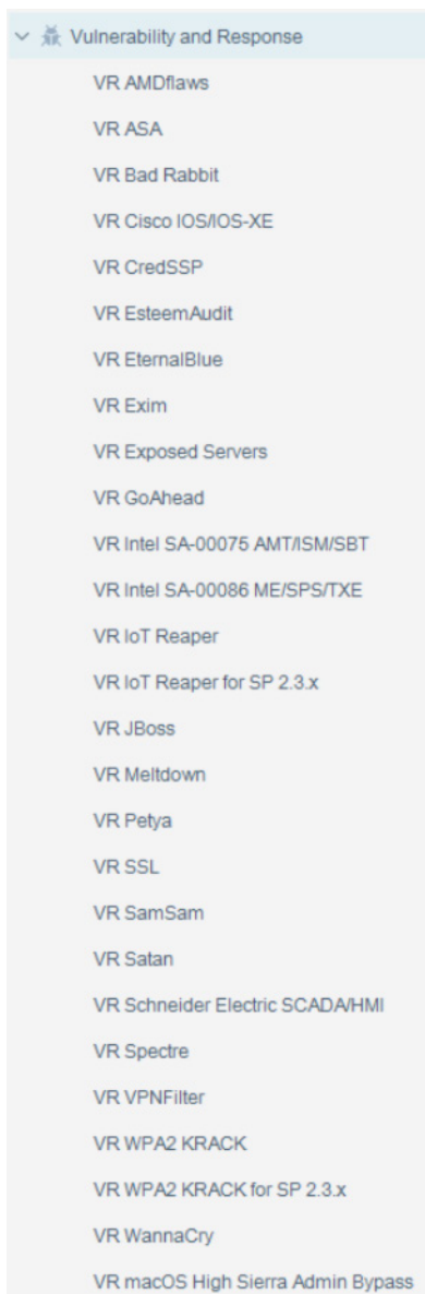
Here is a sample of current ForeScout Vulnerability Response Templates.

The security policy templates include the ability to identify: