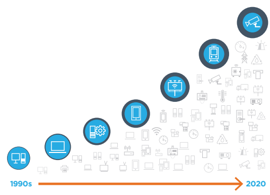
By 2020, there will be 27 billion devices worldwide, 10 billion of which will connect to enterprise networks.<sup>1</sup>

As the convergence of IT and OT accelerates, networks with industrial and critical infrastructure systems are no longer air-gapped from IT networks. Hence, organizations face increased business risk as threats can jump between these domains. Bad actors take advantage of this IoT and OT attack surface to enter your network and move laterally to access sensitive information or cause business disruption.